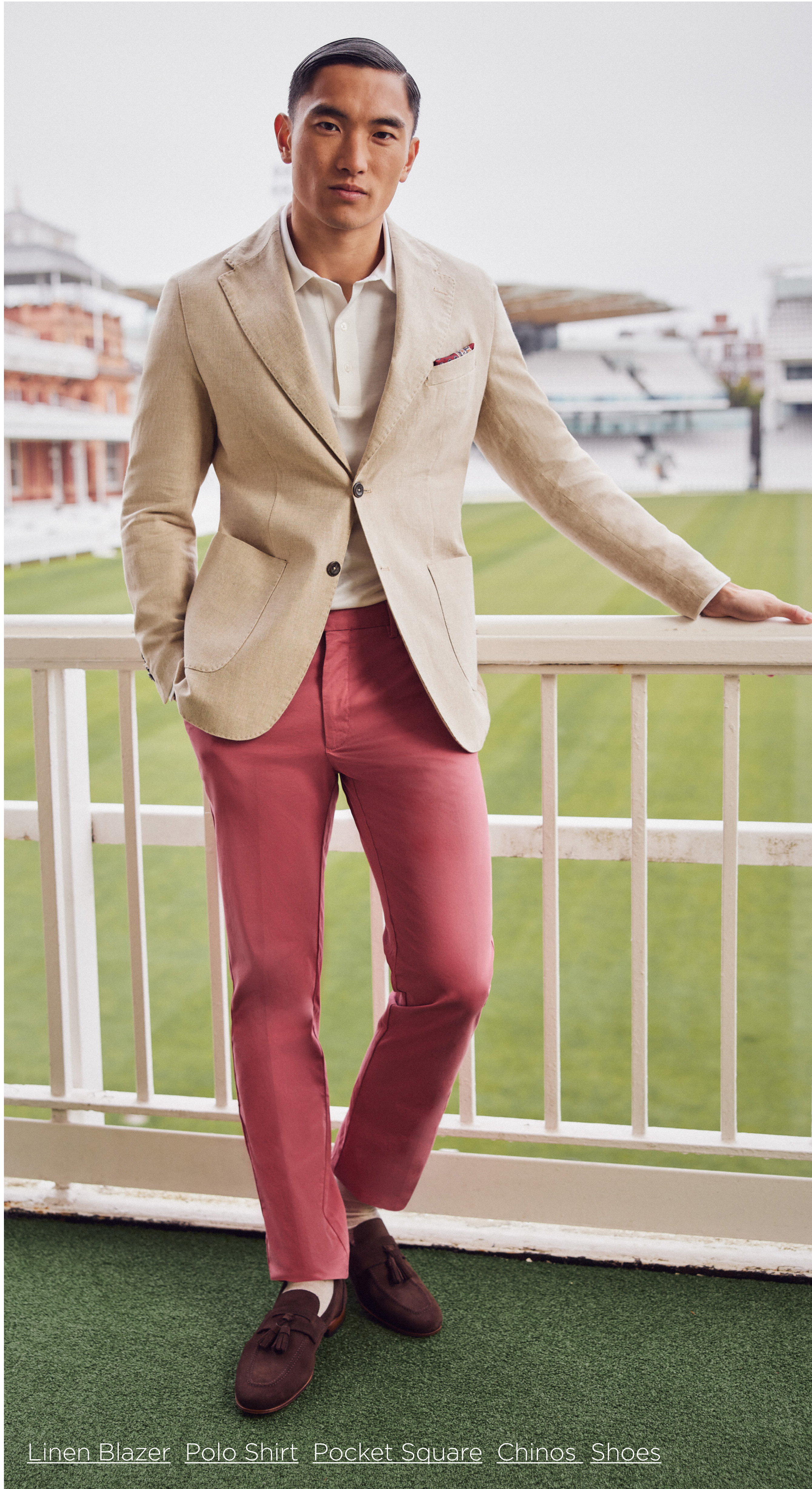
Linen Blazer Polo Shirt Pocket Square Chinos Shoes