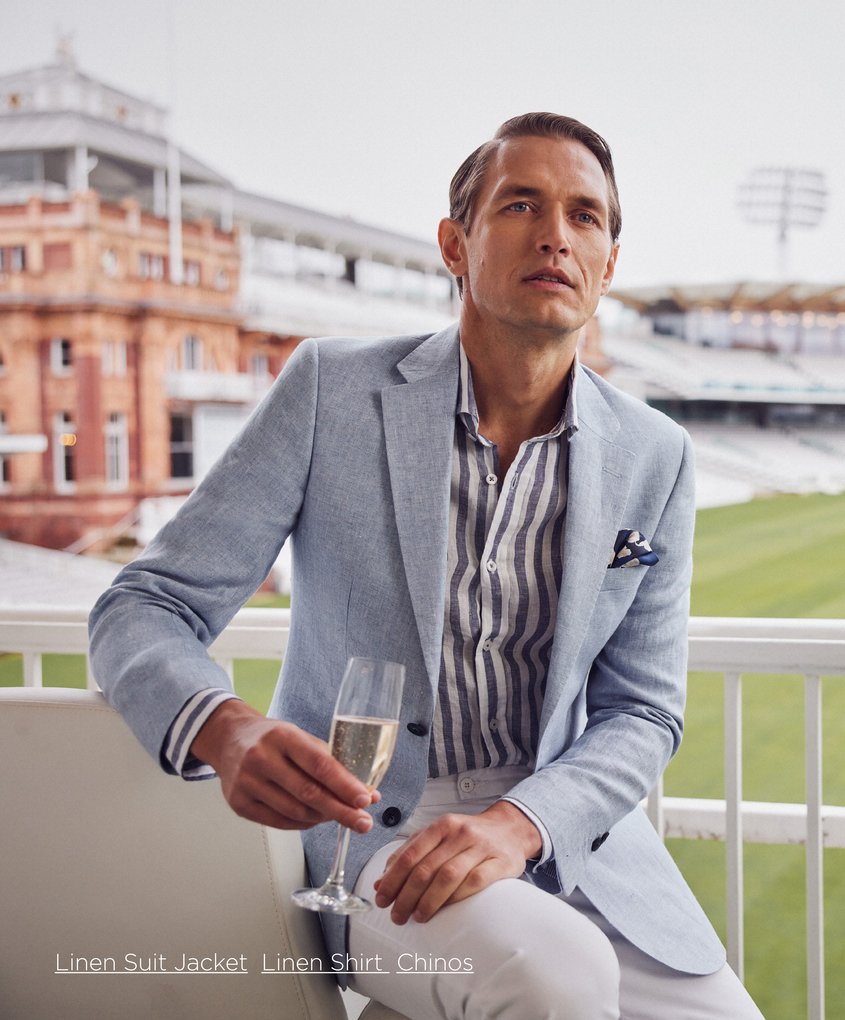
Linen Suit Jacket Linen Shirt Chinos