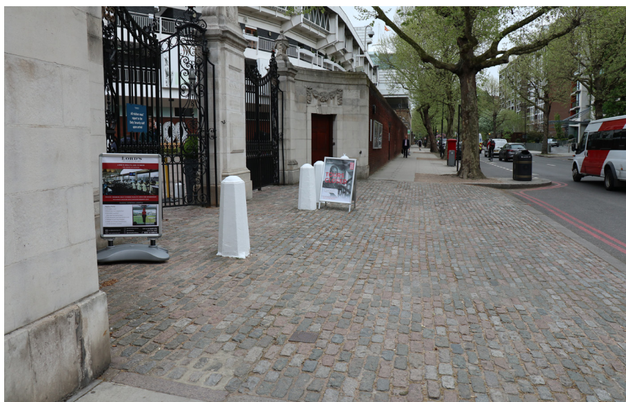
Grace Gate Cobbles from side

Access through the Grace Gate is flat, however there is a cobbled surface outside and immediately inside the Grace Gate that provides a slightly uneven surface.