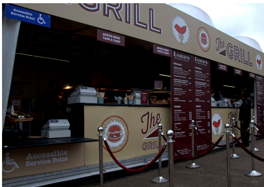
Food Village Accessible Point