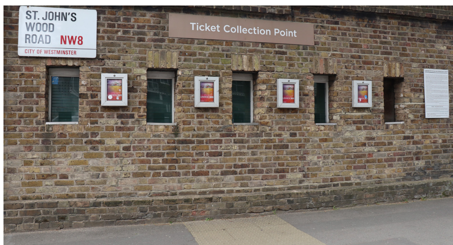
East Gate Ticket Point

The ticket collection point, for spectators who have already purchased tickets and requested to collect them at the Ground, is located at the East Gate. There is no lower, accessible window at the East Gate ticket point. The height of the bottom of the windows varies slightly from 119cm to 123cm.