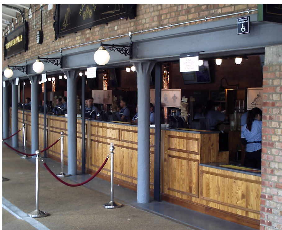
Bicentenary Bar Accessible Point

The Bicentenary Bar, under the Mound Stand, has a lowered accessible counter at its north end. There is smooth ramp access to this end of the bar.