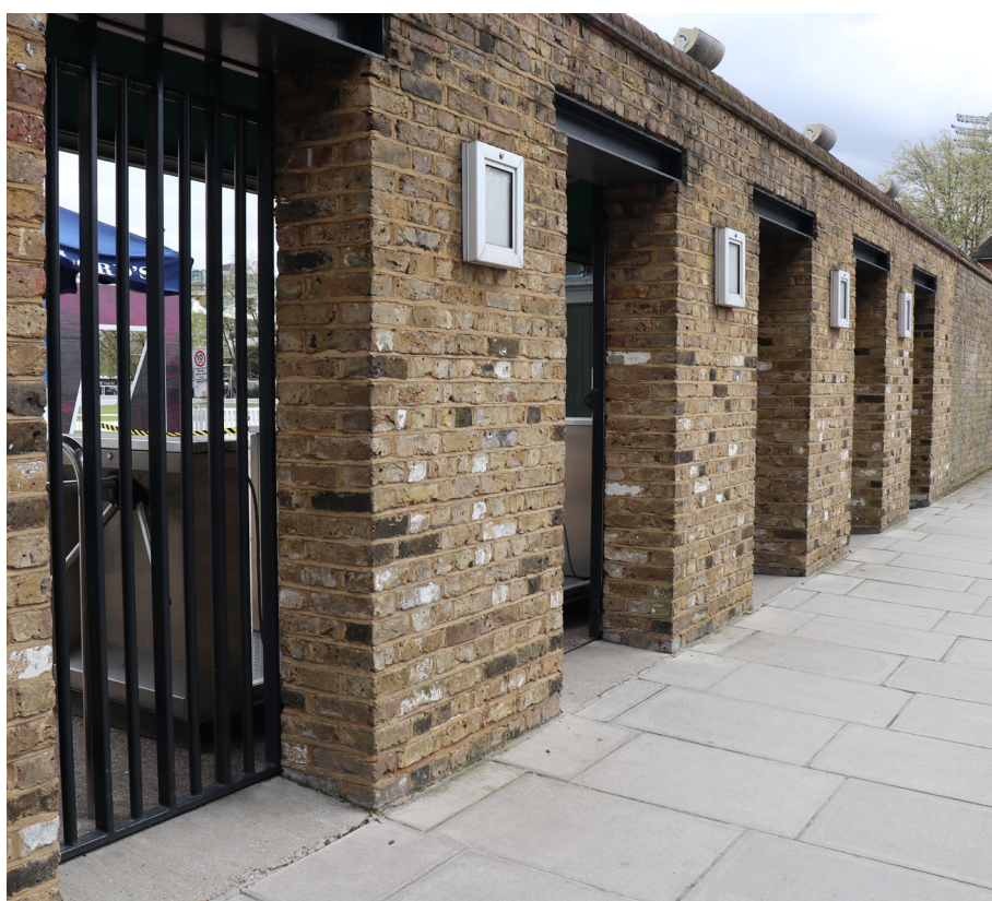
North Gate with Turnstile

The North Gate is in Wellington Place off of Wellington Road. You will usually enter at the North Gate if you have tickets for the Compton or Grand Stands. There is also an entry point for Members and Friends. The approach to the North Gate is a public footpath and is flat and even.