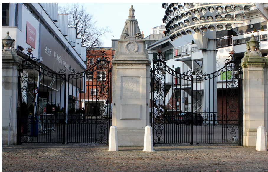
Grace Gate Outside

The Grace Gate is located in the South west corner of the Ground on St John's Wood Road. On Major Match days this is the entry point for MCC Members and their guests.