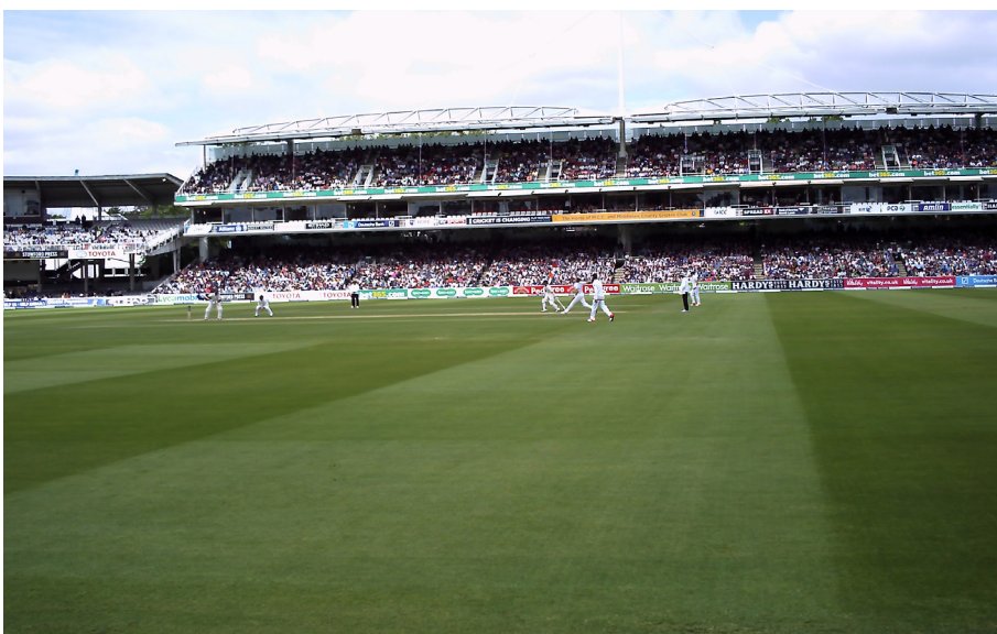
Mound Stand View from the wheelchair accessible space