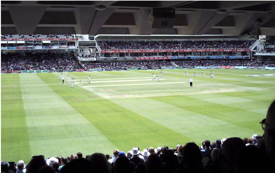
Grand Stand View from the wheelchair accessible space