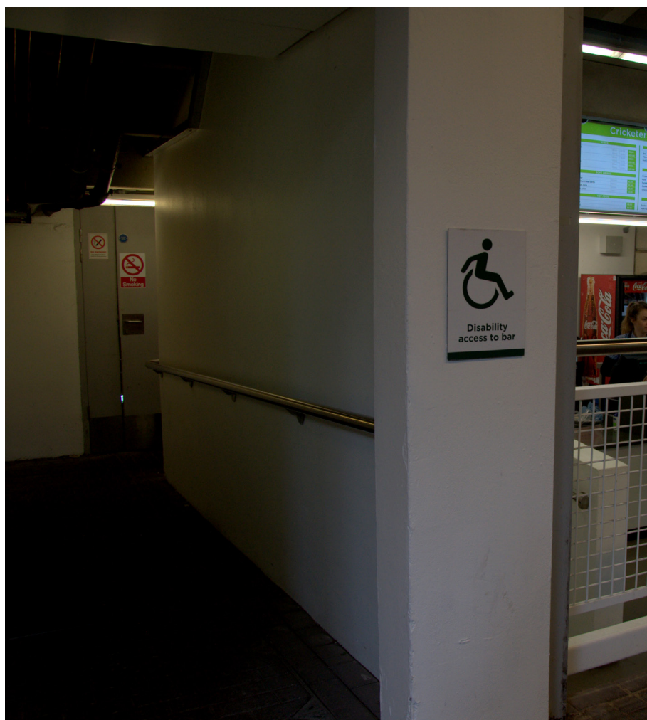
Cricketer's Bar Access

The Cricketer's Bar, under the Grand Stand, is accessed down a ramp to the left of the bar. There is a lower, accessible counter at this end of the bar .