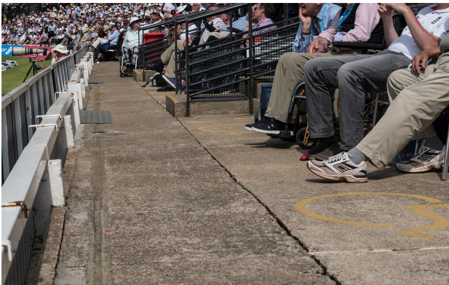
Mound Stand Wheelchair accessible space