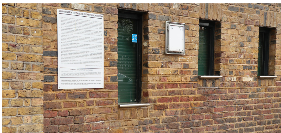
North Gate Accessible Window

Match day tickets, subject to availability, may be purchased at the North Gate. There is a lower, accessible window (Bottom height = 90cm; other windows at 122cm), though there is no knee space available.